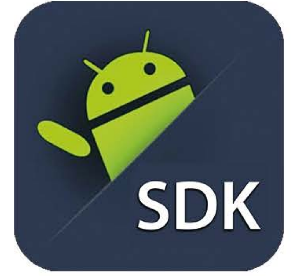
Android SDK Availbale