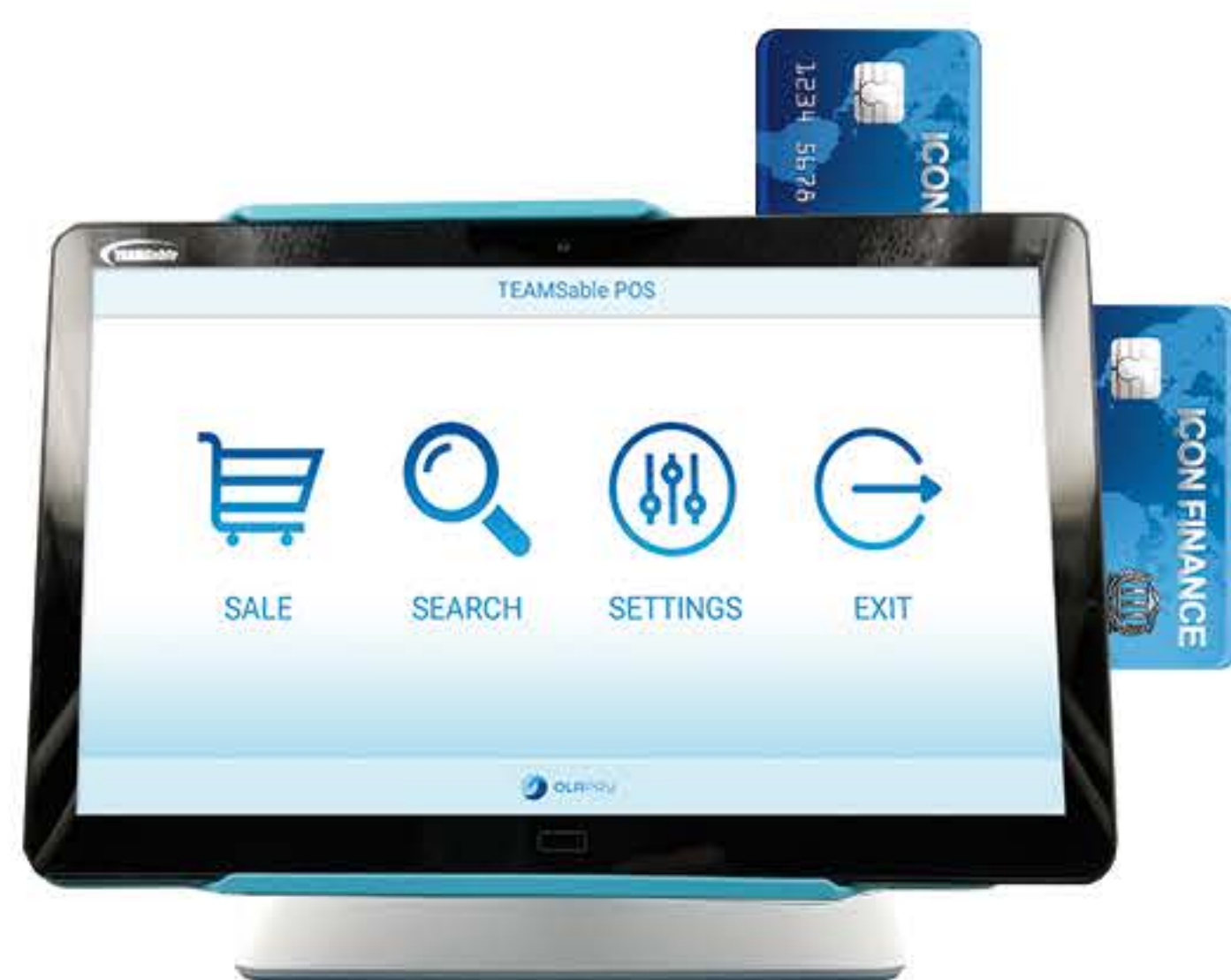
Integrated EMV & MSR