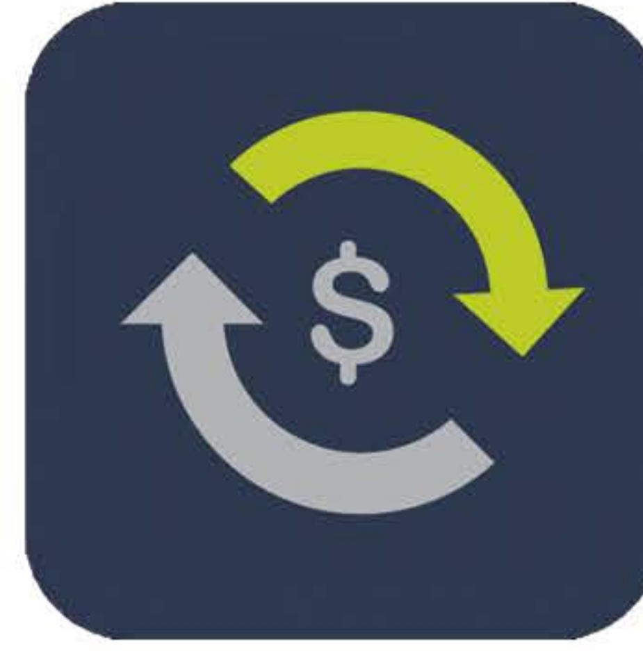
Supports Major Processors