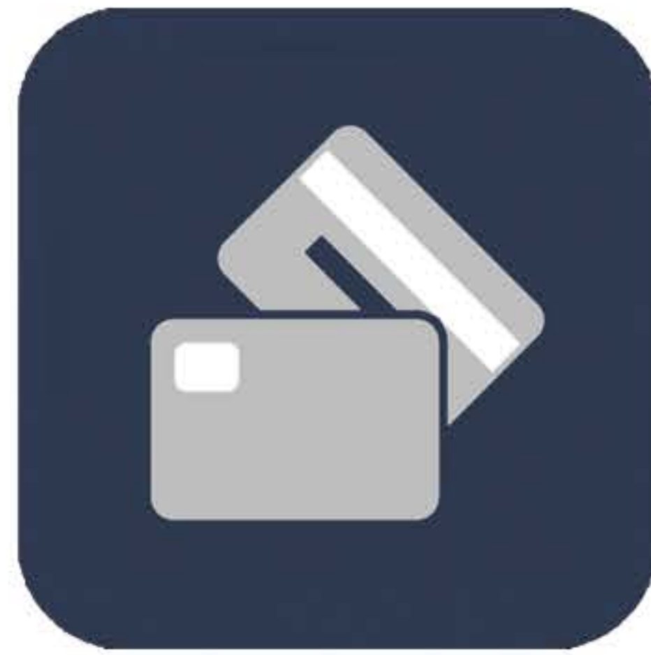
Certified EMV & PCI