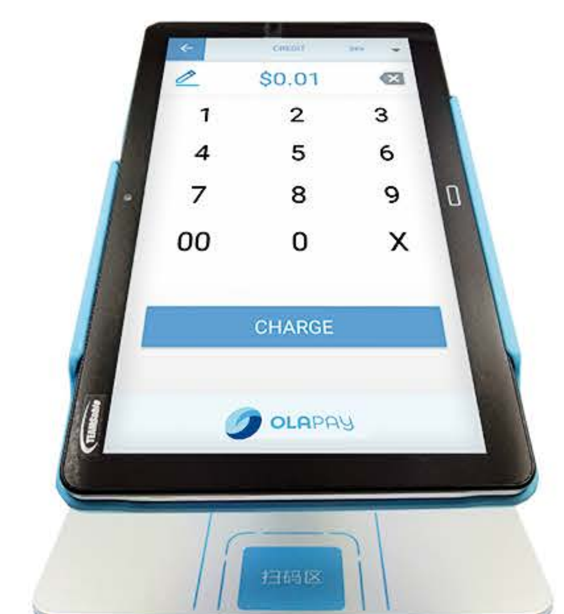
Customer Facing Application