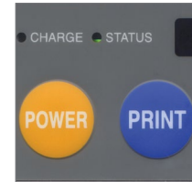
Large Operator Control Buttons