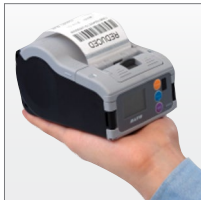
Small & Light Durable & Dependable

Quick and Durable. Ultimate Performance and Mobility.