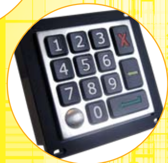
Indoor Version with plastic keys