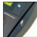
Standard bi-directional magnetic stripe reader