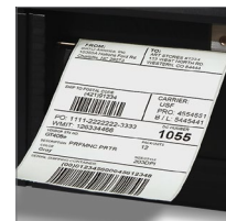
Print Speed Up to 12 ips