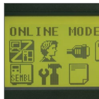
Icon-Driven Operating System for Easy Operation