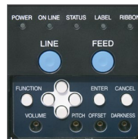
Multi-Function Operation Keys for Flexible Programming